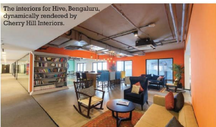
The interiors for Hive, Bengaluru, dynamically rendered by Cherry Hill Interiors.