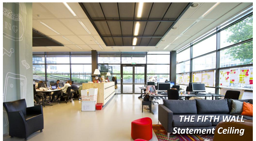
THE FIFTH WALL Statement Ceiling

The emphasis is on comfort and delivering an experience. Hence lot of elements from hospitality is getting incorporated in formal space designs of offices and retail sectors in terms of break-out zones etc. Also, the closed door cabins in design of workspaces is getting replaced with open & free workspaces encouraging collaborative working. Co-working spaces are a perfect example of this emerging trend!