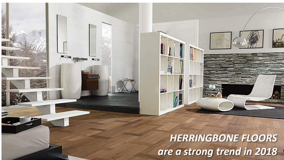
HERRINGBONE FLOORS are a strong trend in 2018

With their fresh, soft and light feel, pastels are back in the game of interiors giving you the sense of calm, simplicity and sophistication